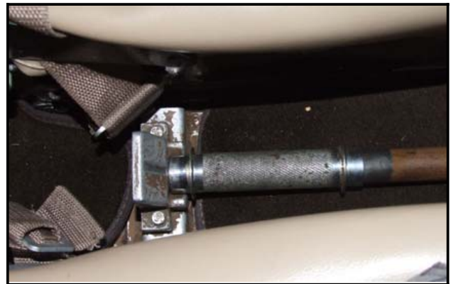
LANDING GEAR HANDLE UPLOCK FIGURE 32-8