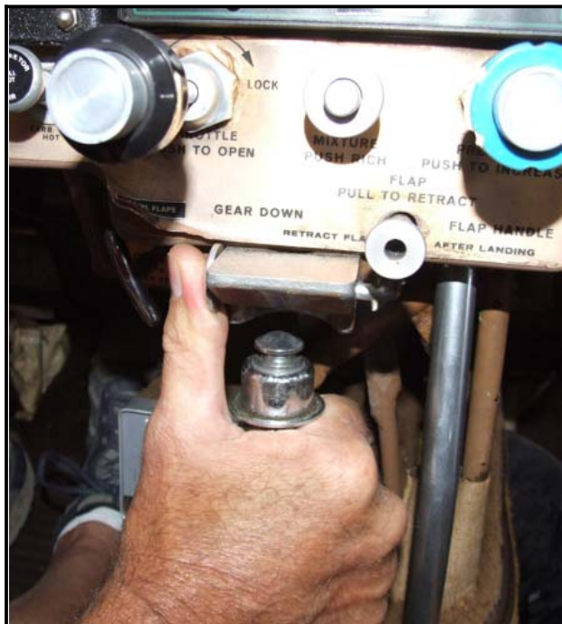
GEAR UNLOCK - PUSH BUTTON RELEASE FIGURE 32-6