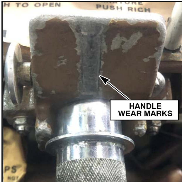
DOWN LOCK ASSEMBLY - WEAR MARKS FIGURE 32-3

THIS BULLETIN DOES NOT CHANGE AIRCRAFT TYPE DESIGN