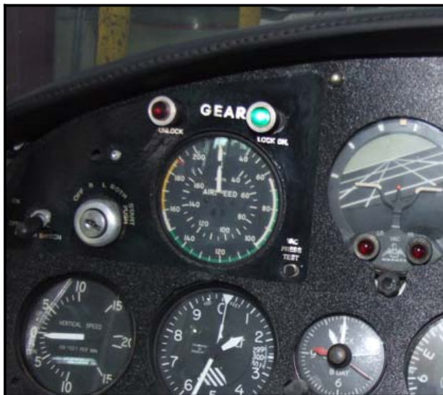
GEAR LOCK "GREEN LIGHT" FIGURE 32-4

The green light indicates that the handle is properly engaged in the down lock position (see Figure 32- 4), and the gear is in the landing configuration. A thumb operated latch is provided on the down lock socket to prevent unlocking of the gear when it is down unless it is deliberately released (see Figure 32- 5).