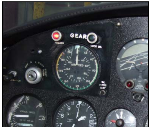
GEAR UP "AMBER/RED LIGHT" FIGURE 32-2