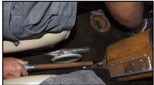
LANDING GEAR HANDLE FIGURE 32-7

Warning horn will sound if gear is not down and locked, and throttle is retarded. Check for green "Down Lock" light. If green light is not working, it can be unscrewed and replaced in flight with the red "Gear Up" light to verify the locked position.