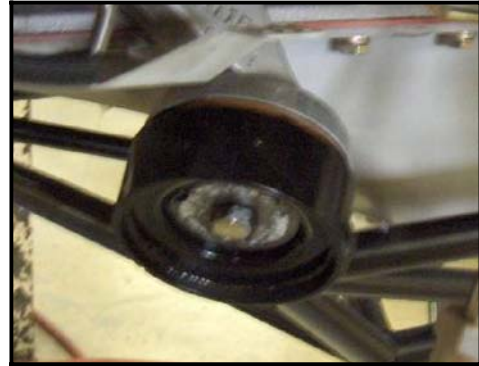
ISOLATOR MOUNT SEATED REMOVE - "DUMMY" BOLTS