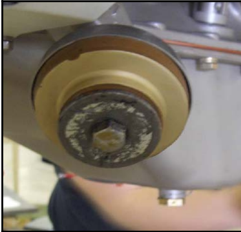
TIGHTEN "DUMMY" BOLTS (NAS6607-15 OR EQUIVALENT) TO COMPRESS RUBBER MOUNTS